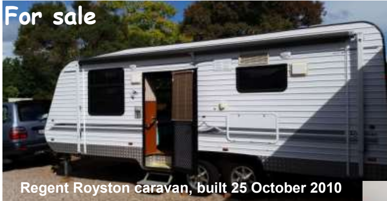
Regent Royston caravan, built 25 October 2010