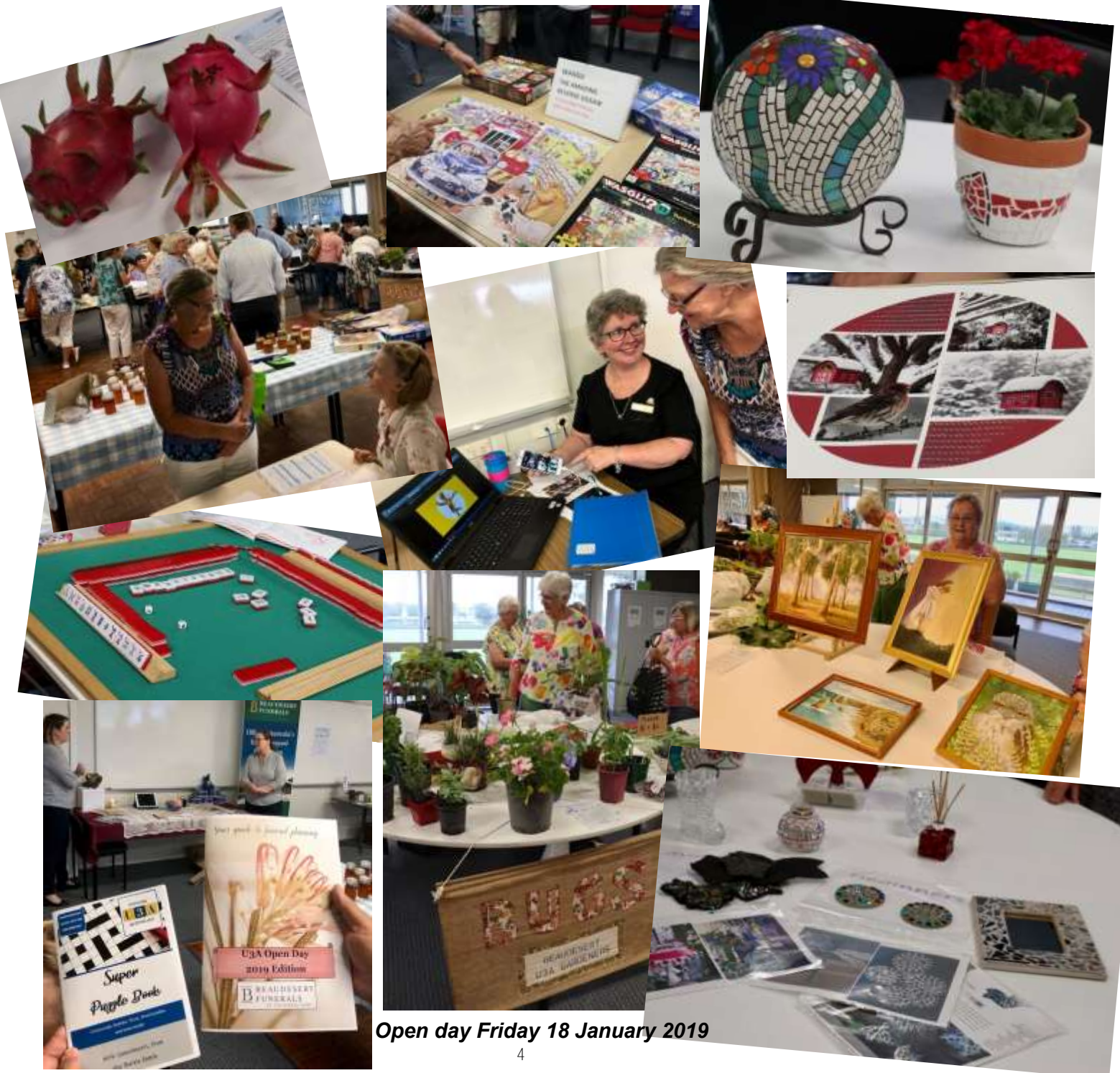
Open day Friday 18 January 2019