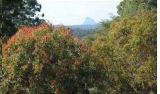
BUGs' trip to Mt Clunie