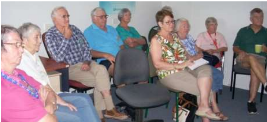
Members of the Meandering Through History group enjoying the talk on the Celts

On 31 January this new course commenced and managed to pique the interest of quite a few people - more than the designers of the course expected, but all were welcomed with great enthusiasm.