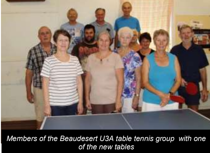
Members of the Beaudesert U3A table tennis group with one of the new tables