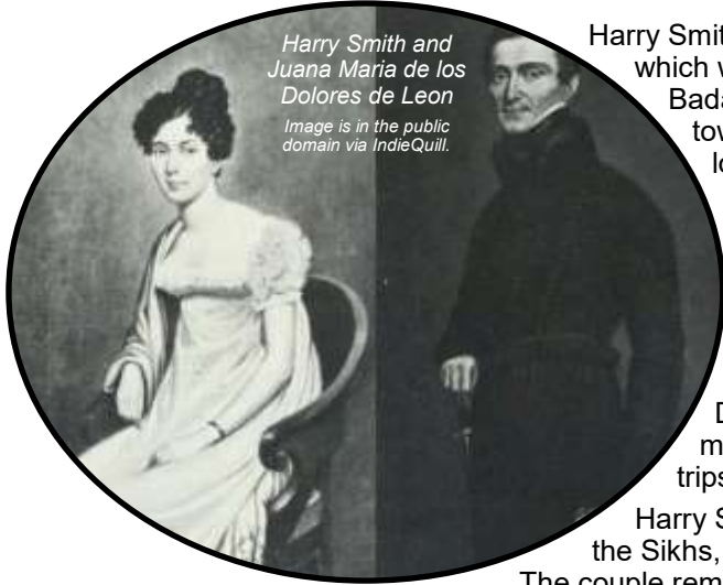
Harry Smith and Juana Maria de los Dolores de Leon

Harry Smith was a gallant British soldier in the war between France and Britain which was waged in Spain; he was involved in the battle of Badajoz in 1812. Badajoz was occupied by the French, and the British army captured the town after suffering terrible casualties. The occupying troops lost control, looting and destroying the town.