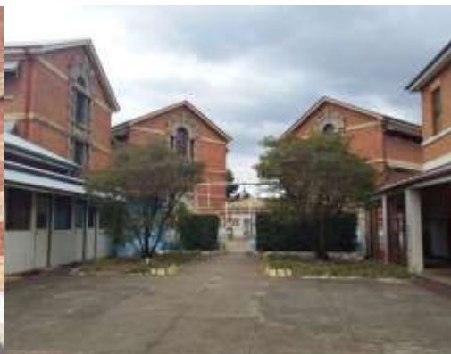
(Top row L-R) The main gate, walkway through to cells, etc (Bottom row L-R) View from exercise yard, "five-star" ablutions block, "private" toilet (Below) Visiting my man