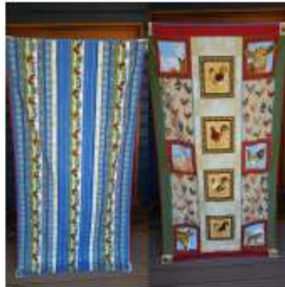
Reversible bed cover 112 cm x 190 cm