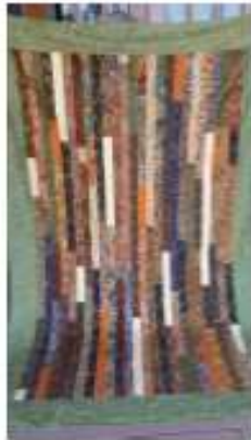
Bed cover 152 cm x 236 cm