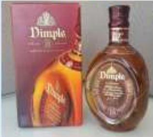
15-year old Dimple