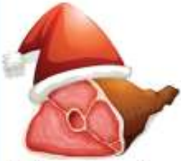
$50 meat voucher Heits Butchery