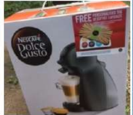
Nescafe Dolce Gusto Coffee maker