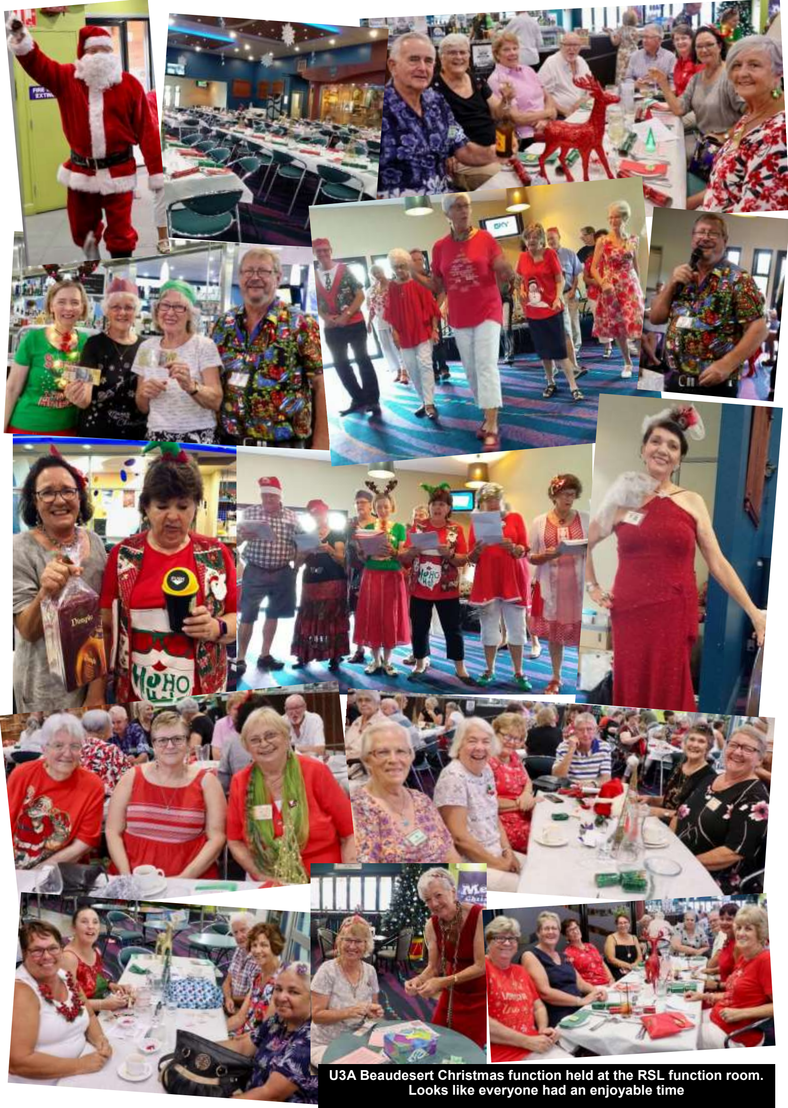
U3A Beadesert Christmas function held at the RSL function room. Looks like everyone had an enjoyable time