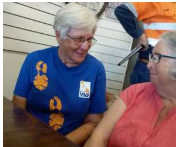
End of year celebrations for two of our activities: (above left) aqua aerobics and (above right and below) nordic walking