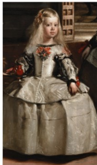
Velazquez, Las Meninas - detail