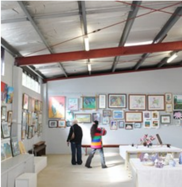
Patrons at the Art Show