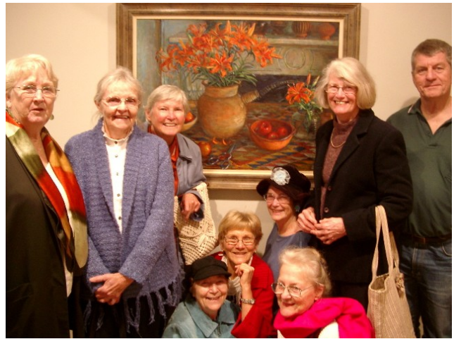
Art Appreciation Group with Margaret Olley painting.