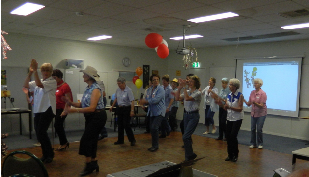
Line dancers in action

that could easily be lost again by joining the line dancers.