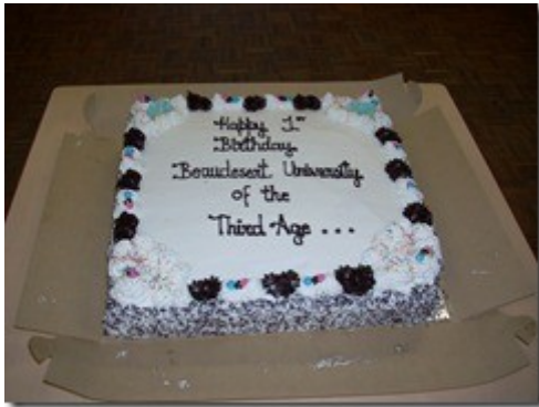
The birthday cake