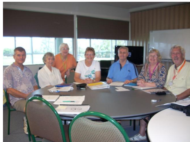
A selection from our fine range of tutors