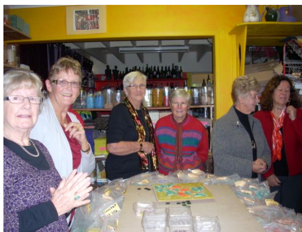
Members of the Mosaic Group at Aladdin's Cave