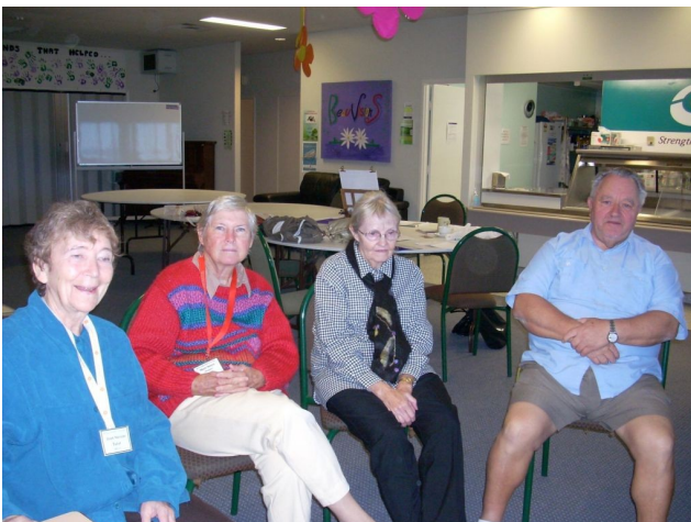
Members of the Art Appreciation Group sampling the Google Art Project