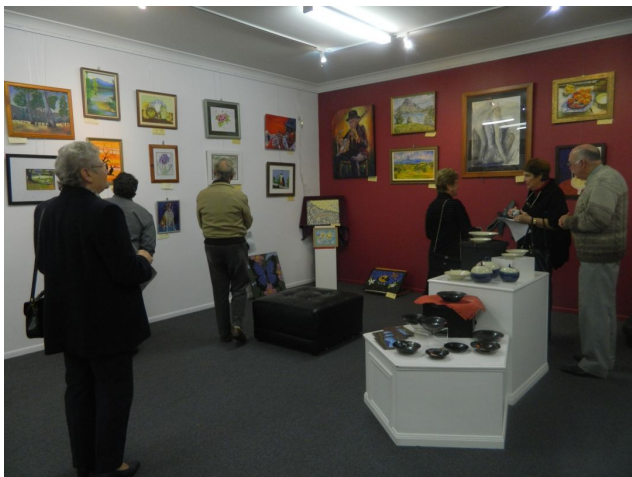
Patrons enjoy a visual feast at the exhibition.